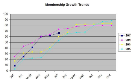
Membership as a percentage of owners.

As of June 15, membership stands at 66, out of a potential 200 riparians. This is slightly below where we were at this time last year. Membership peaked in 2014 with 88 members. This was achieved by a membership drive conducted late in the summer. We again need volunteers this year to help with membership as well as the invasive species campaign. Please come to the annual meeting prepared to volunteer in your part of the lake.