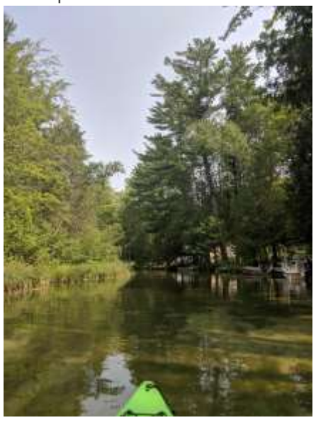
Residents and visitors, alike, must work together to insure a healthy Ann Lake for all to enjoy.

This added expense has us seeking ways to involve more riparians in sharing this cost, even those who have over the years chosen not to become ALPOA members. For that reason we've created a DBA called the <u>Lake Management Fund – Lake Ann</u> to provide a funding mechanism to support these new costs we are sharing with the township. We've also determined we can establish this DBA as a 501(c) (3), making contributions Federally tax deductable should you itemize. This designation would also