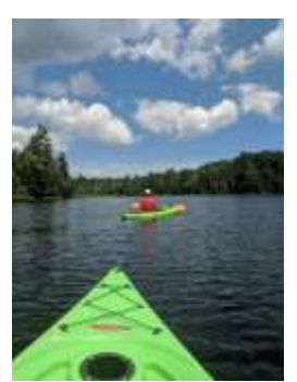
Ann Lake is a beautiful place to kayak.

Picture yourself in your self-propelled water craft at the height of the summer season. Slowly, you propel yourself around beautiful Ann Lake