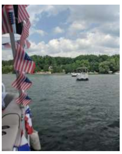
The Fourth of July boat parade is fun for all ages!

SATURDAY JULY 6: ALPOA Booth at Lake Ann Homecoming Days. This is an educational, inspiring, and fun way to learn more about the work of ALPOA. Be sure to have your whole family stop by while you join in this annual community event in Downtown LA.