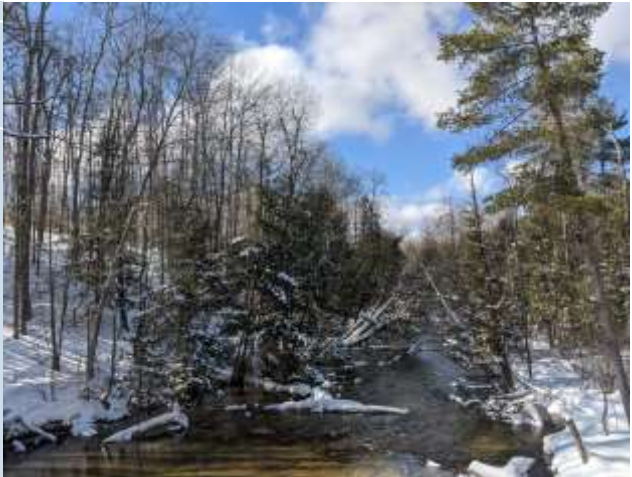
Platte River in February.